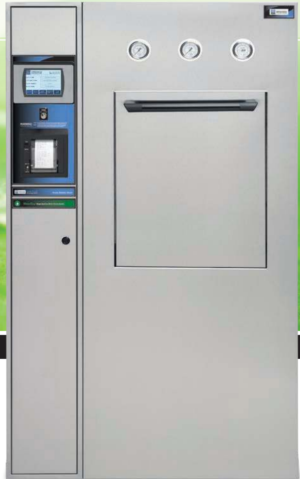
Model 3AV-ADV-PLUS Sliding Door Sterilizer with Consolidated WaterEco® Water Saving System