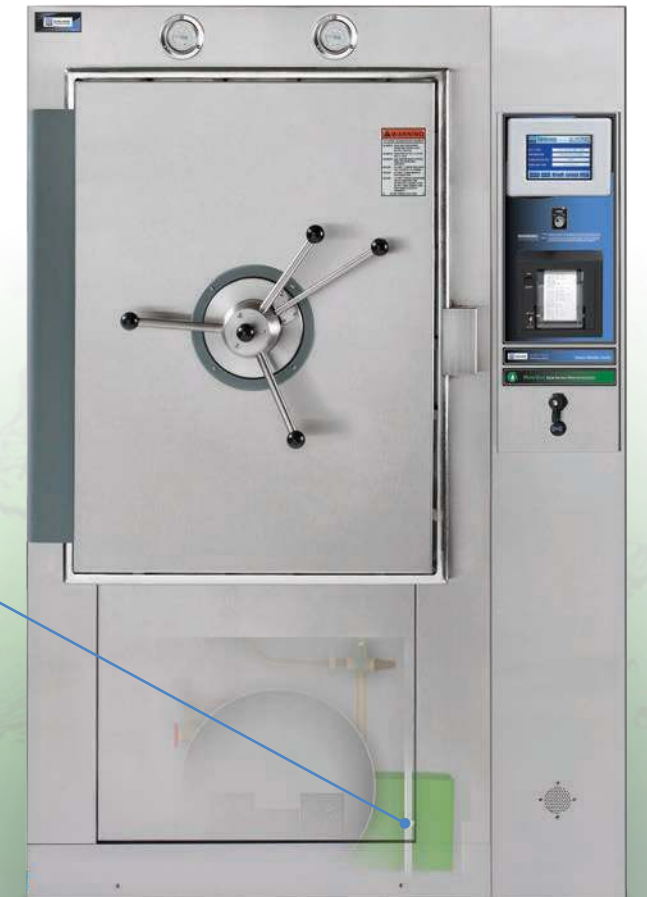
Model SR-24C-ADV-PRO equipped with WaterEco® System

The WaterEco® system is a patented, innovative device that easily incorporates into new sterilizers or can be retrofitted to existing systems.